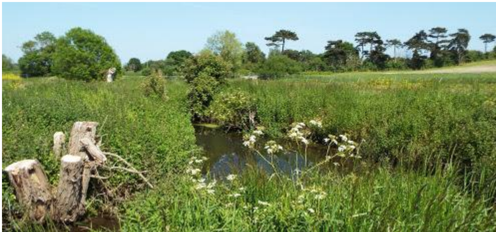
View across Aldhurst Farm Habitat Creation

We would like to thank the community for embracing this project and recognising its lasting legacy for Leiston. We have tried to engage with our nearest neighbours every step of the way as their support for this habitat creation scheme is integral to its success.