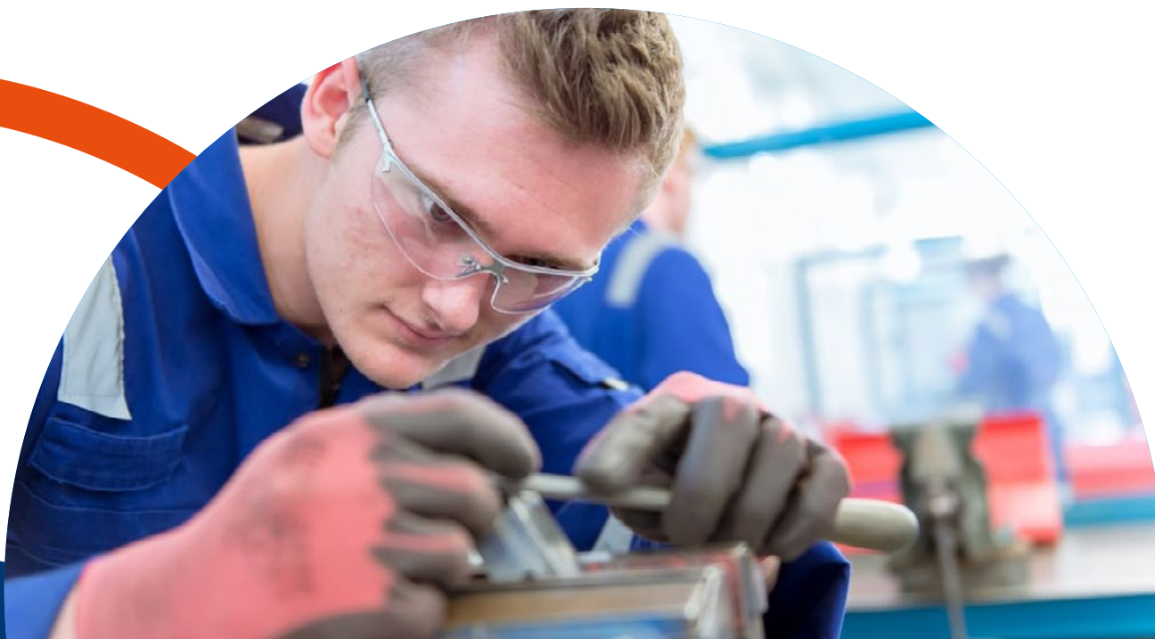
One of our Sizewell C apprentices

The team hosted a stand at the event, speaking to many local businesses interested in opportunities to work on the Sizewell C project, as well as education providers keen to understand the skills initiatives that will be put in place.