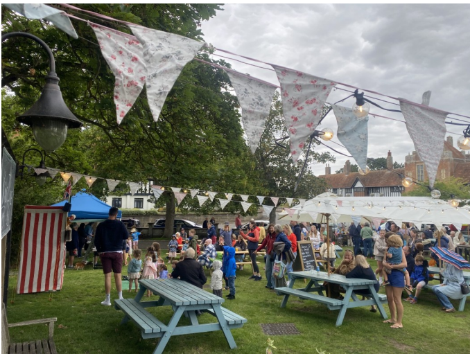
Caption: Punch and Judy at The Dolphin

Thorpeness Fete on August 2 nd provided a great day out for everybody despite odd showers threatening to dampen the fun.