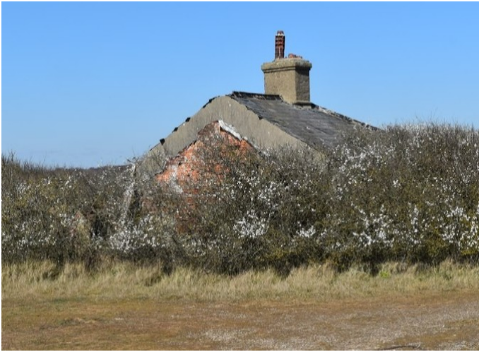
Caption: Sluice Cottage this spring

It is rumoured that Sluice Cottage, the little, dilapidated house standing in fenland between Thorpeness and Aldeburgh, has been sold. A drawback to previous sales has been its lack of connection to any mod-cons, combined with onerous covenants stipulating what is and is not allowed.