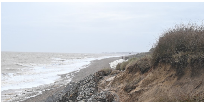
Caption :- The old sea defences now in ruins and a prayer left anonymously close to North End Avenue

The document adds: "The Environment Agency's National Coastal Erosion Risk Map (NCERM) for this frontage shows erosion risk zones up to 2055. The current risk zone for 2055 is seaward of the road and therefore suggests residents landward of the road have a 30-year period in which erosion risk should not impact their access or home. However, we also know that the Ness, a geological subsea feature to the north of North End Avenue, also influences rates of erosion along the frontage and this is much harder to predict." The NCERM can be viewed here: Thorpeness MIN13.3 | Shoreline Management Plans.