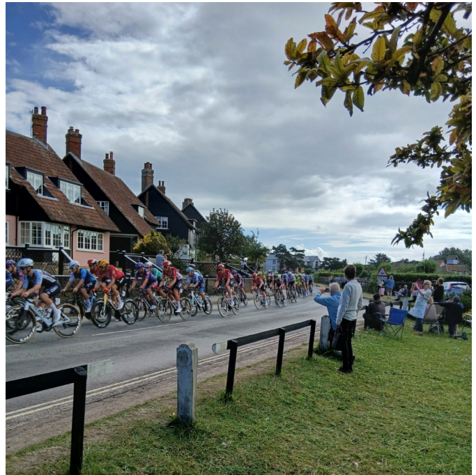
Caption:- On-lookers cheered on the cycle racers in Thorpeness