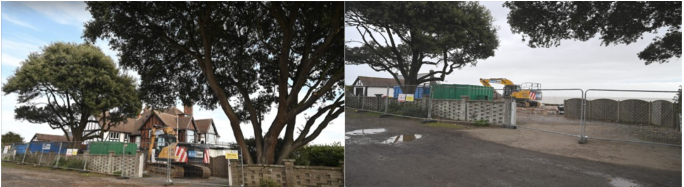
Caption:- The second house on North End Avenue to be demolished was The Warren, pulled down in November. This is the site before and after