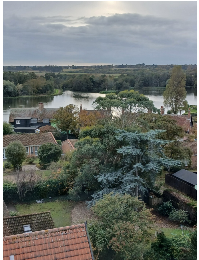
Caption:- View across Thorpeness to the Meare from West Bar Water Tower taken during a TAHG event in October