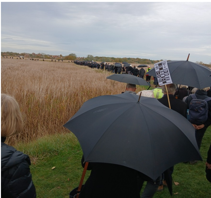
Caption:- Demonstrators against the cumulative impact of numerous energy projects wend through the reedbeds at Snape Maltings

Dressed in black and many carrying black umbrellas the 'mourners' processed through the reed beds to the front of the concert hall where many went on to attend the two day public hearing.